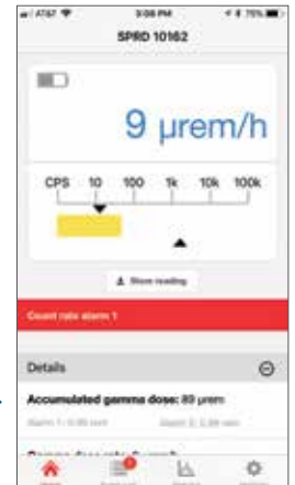
Alarm activated on RadEye App