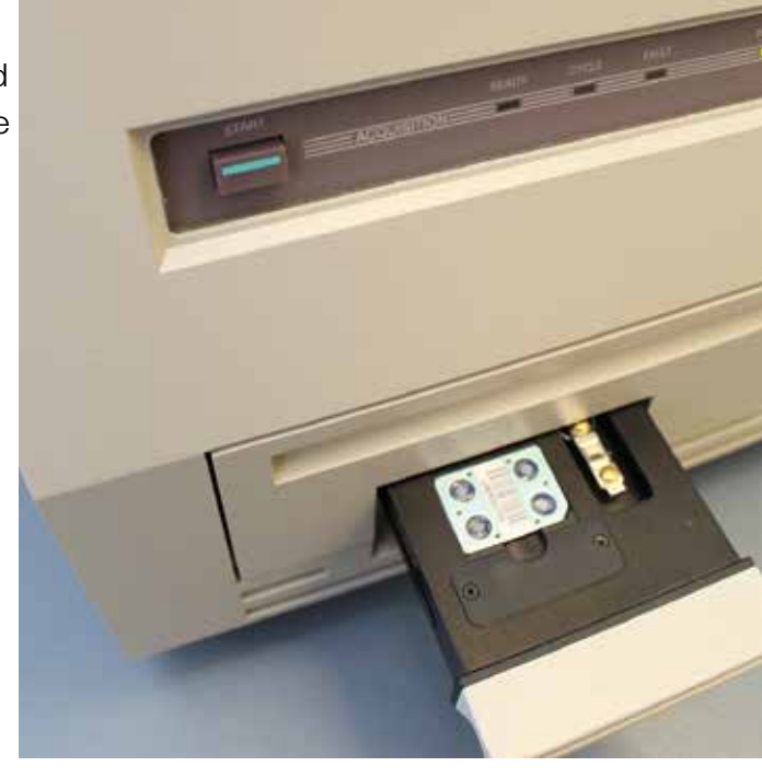
The Harshaw 4500 is equipped with a planchet heating assembly used for unmounted dosimeters and a precisely controlled non-contact nitrogen gas heating system with dual cooled photomultiplier tubes for reading mounted TLD elements in the form of multi-element cards or extremity dosimeters.